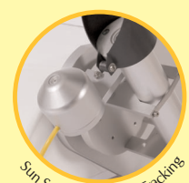
Sun Sensor for Active Tracking