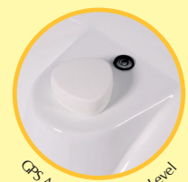
GPS Antenna & Bubble Level