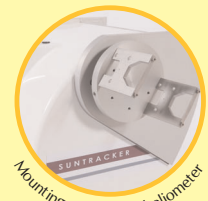
Mountings for CH1 Pyr heliometer