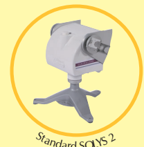
Standard SOLYS 2